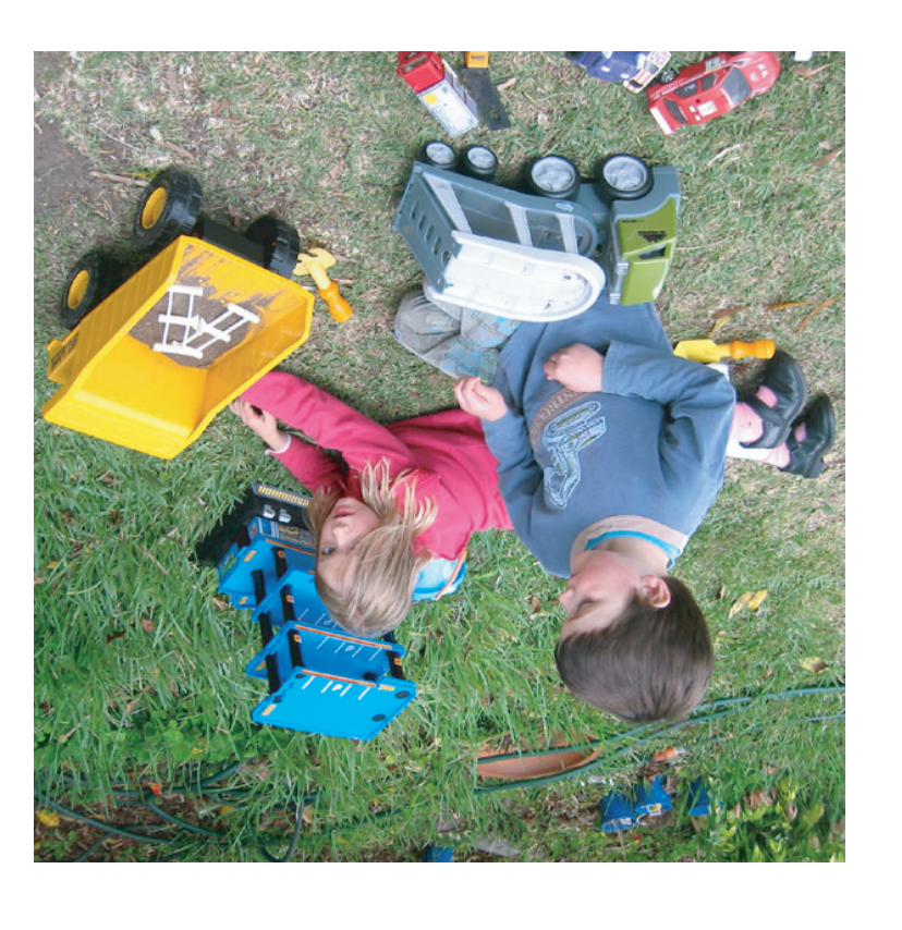
J Z 3 4 ILNCKS